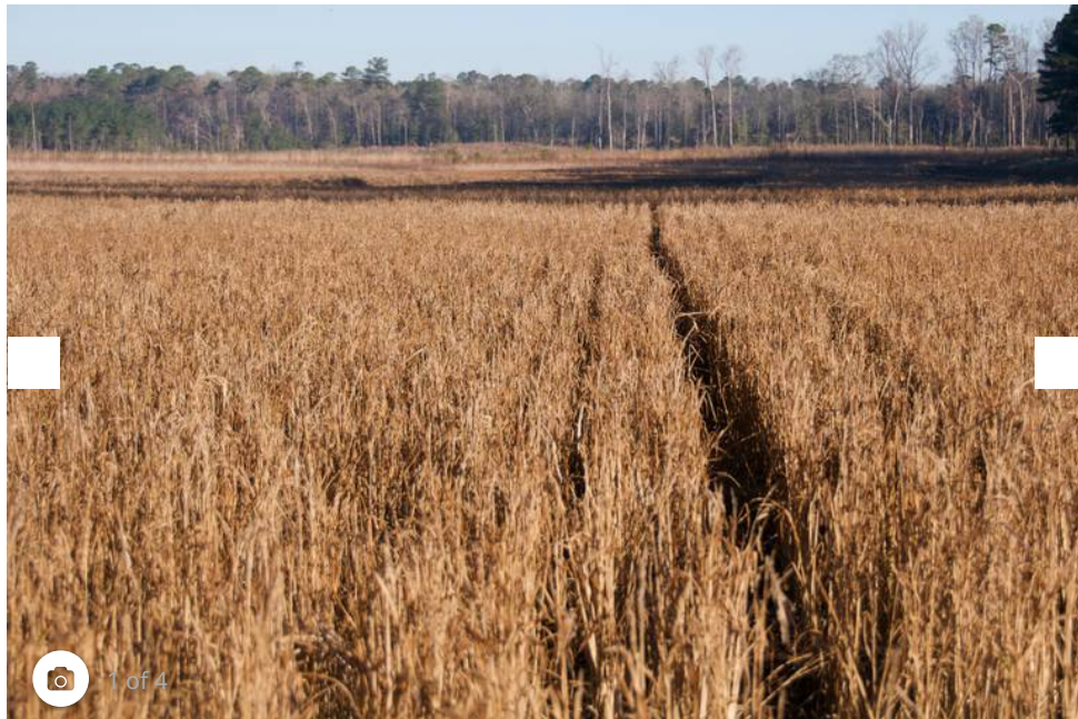
A photograph of the Slater Duck Ponds property in Jasper County, purchased by The Open Space Institute in October.

This story was originally published November 1, 2021 3:00 PM.