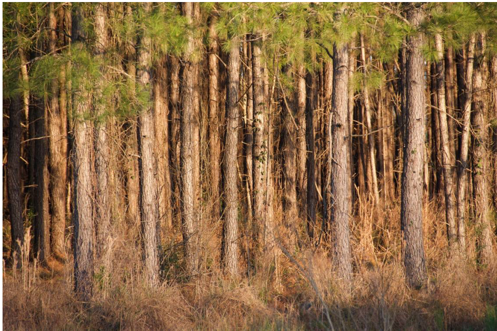
A photograph of the Slater Duck Ponds property, purchased by The Open Space Institute in October.

Along with offering public space for birdwatchers, hunters, hikers and cyclists, the Slater Duck Ponds property is also home to more than 200 acres of wetlands. The wetlands provide refuge for an estimated 70 species classified as “Greatest Conservation Need” by the South Carolina Heritage Trust program and the State Wildlife Action Plan, the news release said.