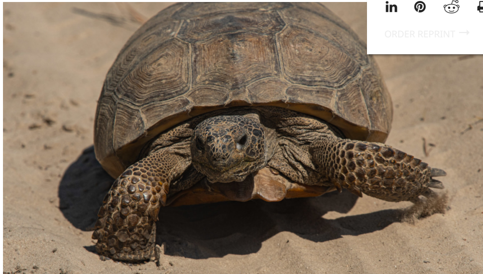
The Slater Tract is home to one of the largest gopher tortoise colonies in South Carolina.