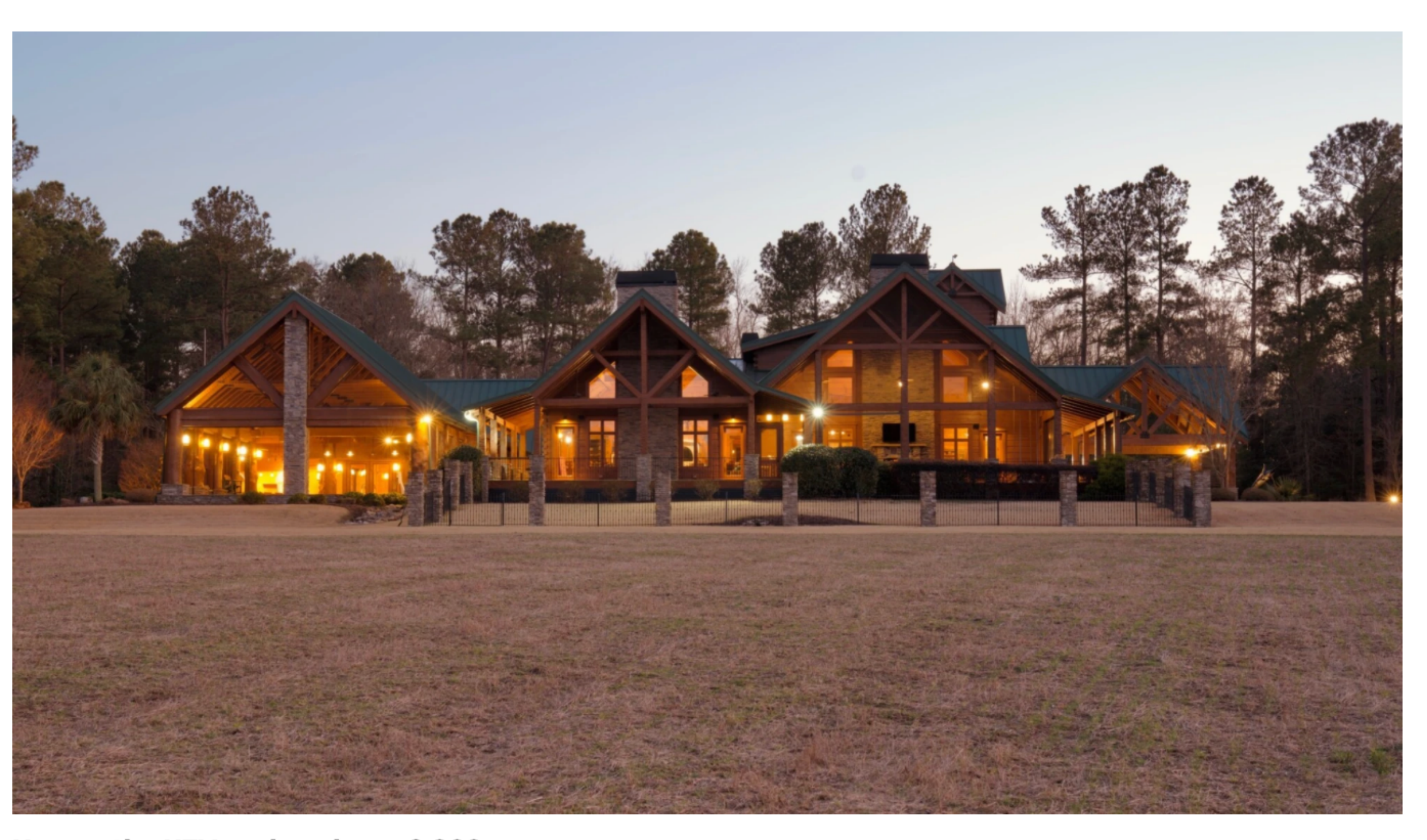
Hop on the UTV and explore ~2,800 acres.

If Capital City life has you dreaming of wide open spaces, a home on Lake Murray or a farm outside Columbia might be calling your name . Whether you dream of morning horseback rides, sunsets on the lake, or a true sportsman's paradise, these luxury homes offer the perfect escape.